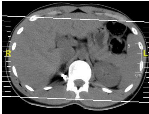
Figure 2. CT scan of thoracic vertebrae region

This surgery is a joint operation performed by a neurosurgeon. The patient planned surgery to extract the corpus allienum through a lateral extra cavitory approach to expose the lungs at the level of the Th10-12 vertebrae (Figure 3). The corpus allienum was a metal bullet at the lung base as high as the Th12 vertebrae. After removing the bullet, the patient experienced a decrease in pain scale to 1-3 on the first day after surgery. Pain continues to decrease, and there are no signs of postoperative infection.