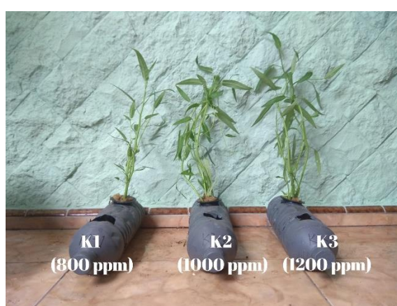
Figure 1. The view of water spinach growth in the various concentrations treatment using AB Mix

Information: (**) = Very significant effect; K = Concentration of AB Mix